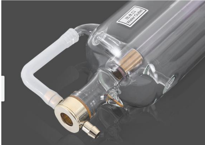
S 80w-150w laser tube