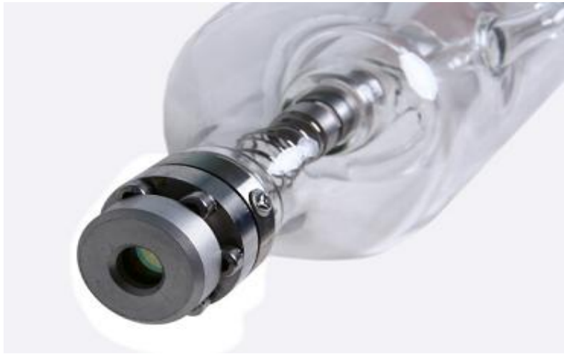
ZS 80-150W laser tube