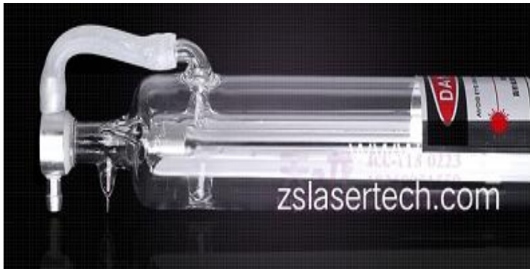
Z 60W-130 laser tube