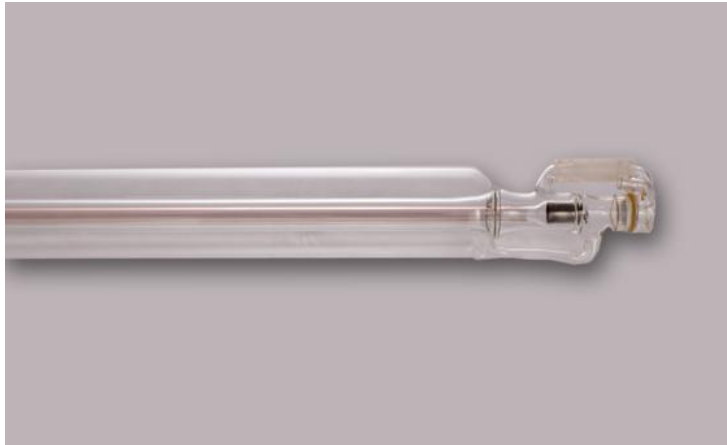
Z 40W Co2 laser tube